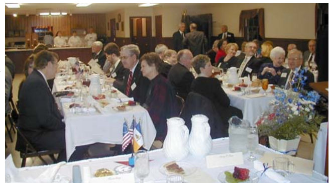
The Charter Banquet was held at the Community Center.

We inaugurated the Collins Chapter at a banquet in October 2000 at the Cheatham Hill Community Center and return there to recognize the past year’s accomplishments on January 18th.