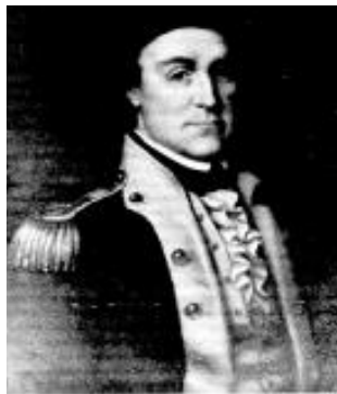
Col. Elijah Clarke