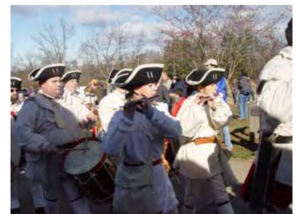
The predictably cold and windy day did not prevent a huge turnout including many