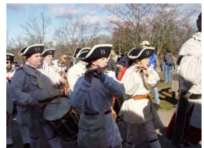
The predictably cold and windy day did not prevent a huge turnout including many