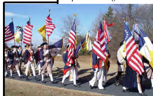
color guard units and a pipe and drum corps as well as spectators and an encampment.