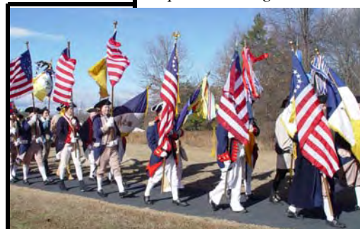
color guard units and a pipe and drum corps as well as spectators and an encampment.