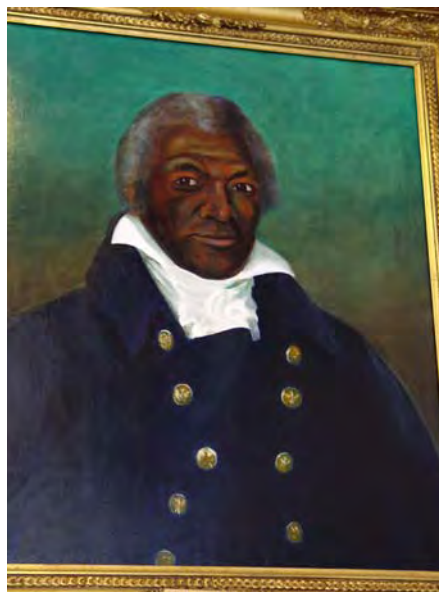
This portrait hangs inside the front door to the Headquarters of the National Society of the Sons of The American Revolution. James Armistead Lafayette was a black slave.

Armistead was able to gather vital information about troops and movements that he sent directly to Lafayette! Cornwallis came to so trust Armistead that he asked him to